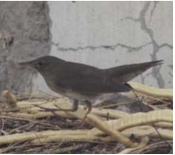
Left: Red-headed Bunting Emberiza bruniceps , Emirates Palace Right: River Warbler Locustella fluviatilis , Mushrif Palace Gardens