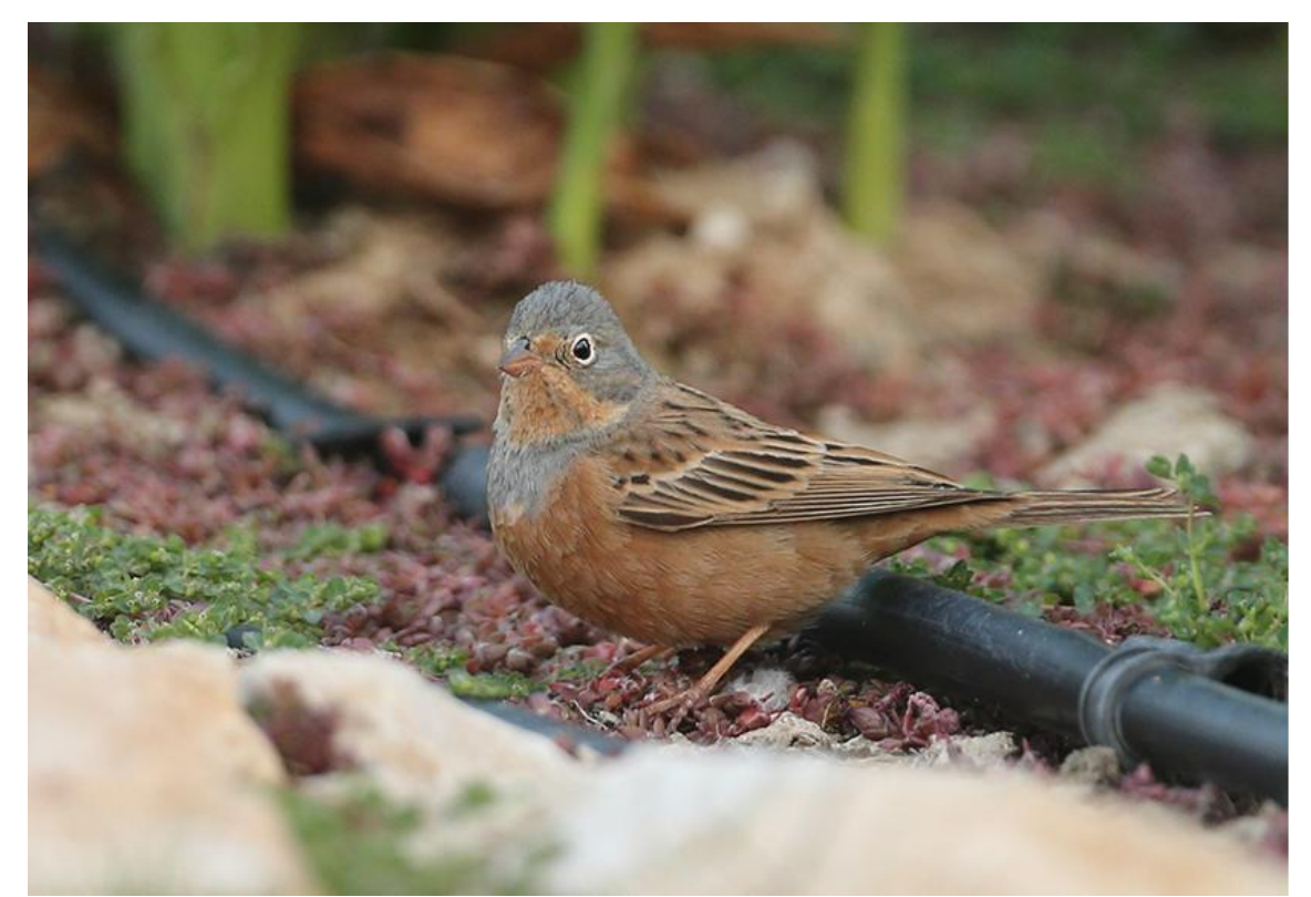
Cretzschmar's bunting Emberiza caesia