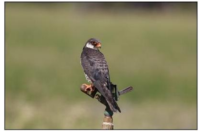
Left: Brambling Fringilla montifringilla, Mercure Hotel Right: Amur Falcon Falco amurensis, Al Qua'a Fodder Fields