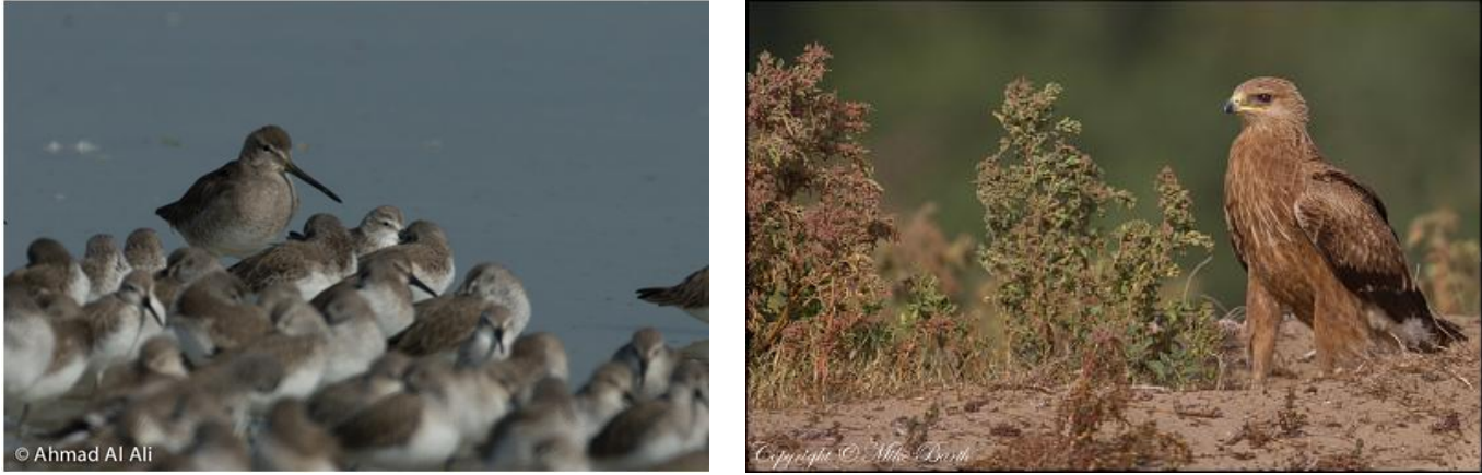
Left: Long-billed Dowitcher Limnodromus scolopaceus , Khor al-Beida © Ahmed Al Ali. Left: Lesser Spotted Eagle Aquila pomarina , Dubai Pivot Fields, © Mike Barth.

Long-billed Dowitcher ( Limnodromus scolopaceus ) Pheasant-tailed Jacana ( Hydrophasianus chirurgus )