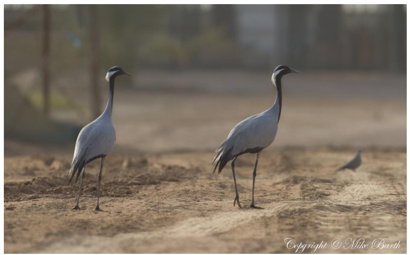
Demoiselle Cranes Grus virgo, Al Qua'a Fodder Fields © Mike Barth.