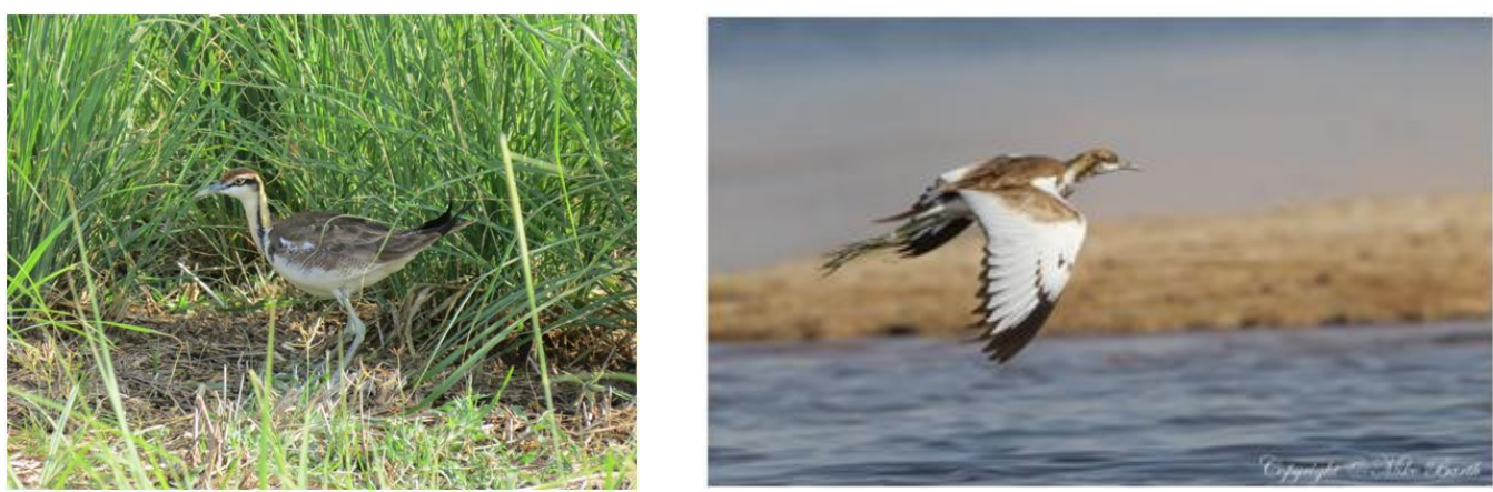
Left: Pheasant-tailed Jacana Hydrophasianus chirurgus, Wamm Farms, Right: Pheasant-tailed Jacana Hydrophasianus chirurgus, Zakher Lake.