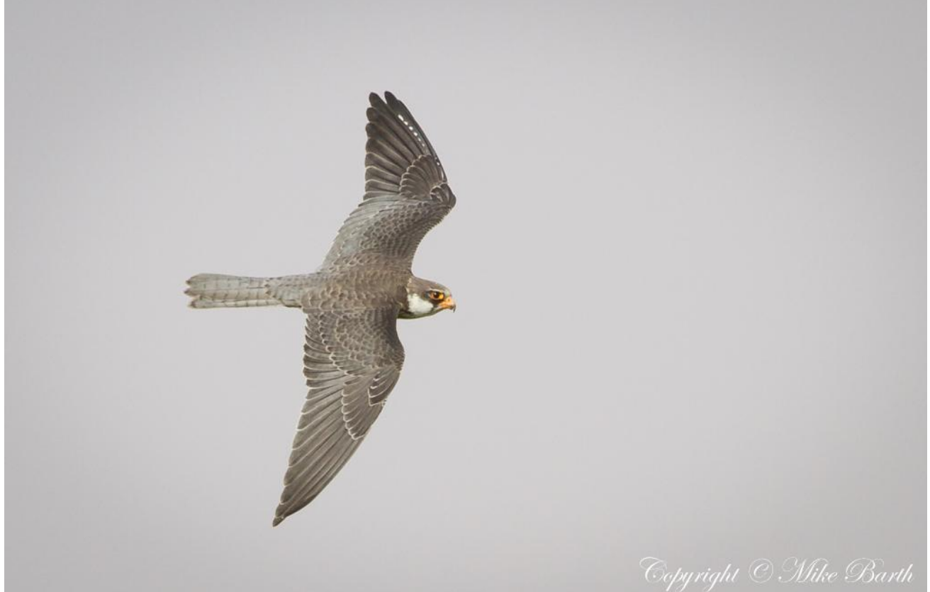
Amur Falcon Falco amurensis, Al Qua'a Fodder Fields