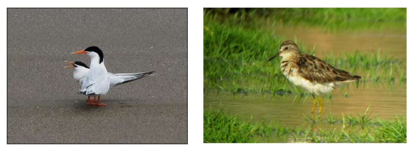
Left: Roseate Terns Sterna dougallii, Fujairah Port Beach. Right: Long-toed Stint Calidris subminuta, Hamraniyah Nursery. Birds of the United Arab Emirates Annual Report 2013